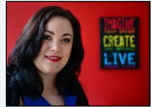
Cooperation rather than competition in Bridgeport theater scene