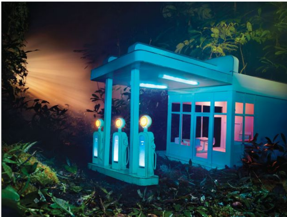
David LaChapelle's "Gas 76" photograph will be featured in a one-artist show, as part of "Images 2014" at the Fairfield Museum and History Center.