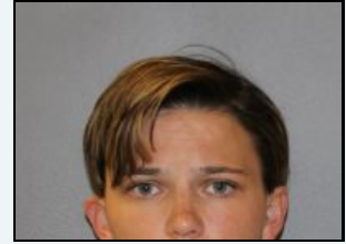
Arrest made in QU graduation 'threat'