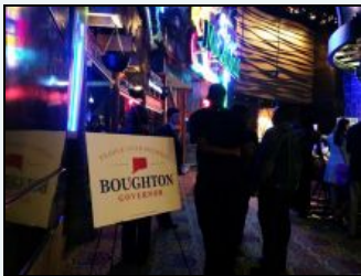
Clubbing with the GOP at Mohegan Sun

often draws inspiration from historical references and uses exaggerated scale and color palettes."