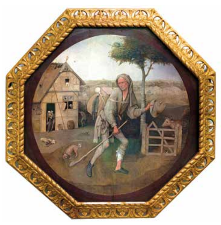
"THE WAYFARER" ALSO KNOWN AS "THE PEDLAR" BY HIERONYMUS BOSCH, THE BOIJMANS MUSEUM, ROTTERDAM, IS AN OIL ON PANEL, CIRCA 1500. THE MUSEUM IS THE ONLY DUTCH MUSEUM THAT OWNS ANY PAINTINGS BY BOSCH.

I am in my element here. The whole town has reinvented itself as a daily Bosch festival celebrating the 500<sup>th</sup> year since the death of Hieronymus, its most famous citizen. In the Noordbrabants Museum show devoted to Bosch I am looking into the utterly mad