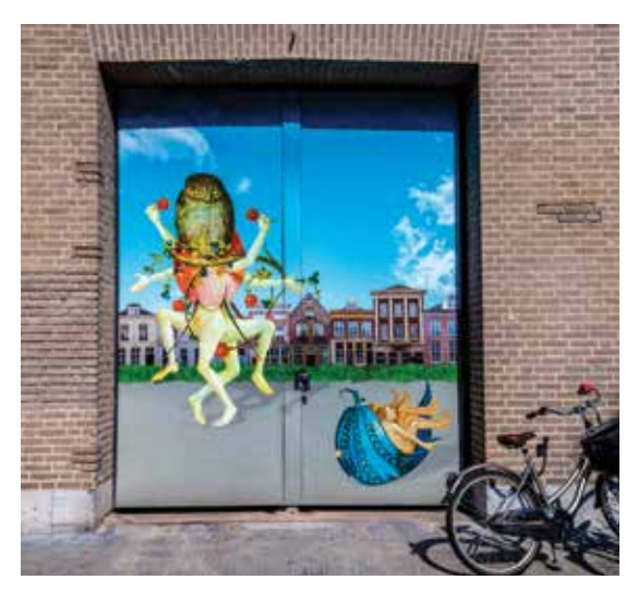
BOSCH DESIGNS AND MOTIFS IN DECAL FORMAT IN THE STREETS OF 'S- HERTOGENBOSCH AS PART OF THE CELEBRATIONS FOR THE 500TH YEAR OF HIERONYMUS BOSCH'S DEATH IN 1516.

The leading Bosch experts today tend to see him in a much more conservative light. Bosch is described by contemporary scholars as a deep religious believer; a traditional member of a traditional church; a severe moralist; a painter committed to depicting the deadly sins not to excite us with the rich and varied nature of human experience, but to warn us of the horrific Hell